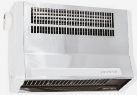
STAINLESS STEEL BHC SS

Dimensions (mm) 300(w) x 190(h) x 115(d)mm