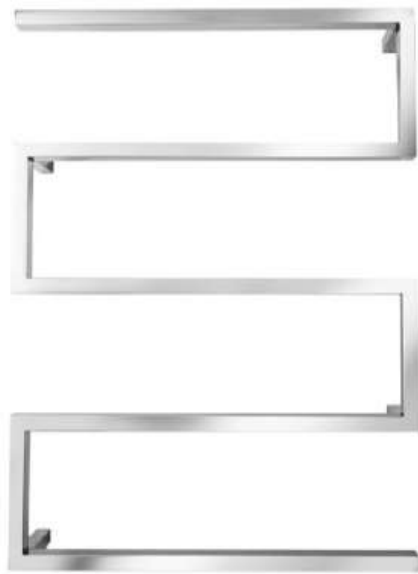
'S' 5 bar SQUARE PSS