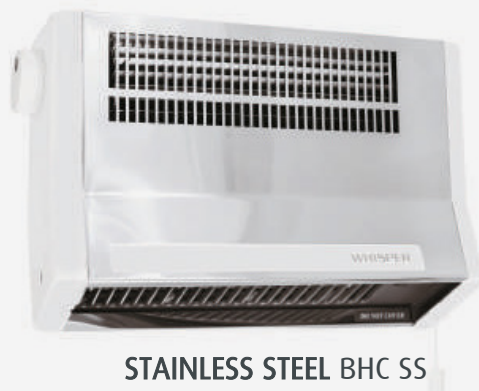
STAINLESS STEEL BHC SS

Dimensions (mm) 300(w) x 190(h) x 115(d)mm