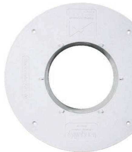
Back to wall flange – 100mm BFLC100

PVC leak control flange | Suitable for all Tranquillity channel drains and point drains Available in 2 sizes - 80mm and 100mm | Promotes adhesion to the waterproofing membrane