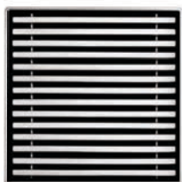
Point drain MESH FD11XS65-M

Point drain SOLID BR SS - Available in 4 finishes