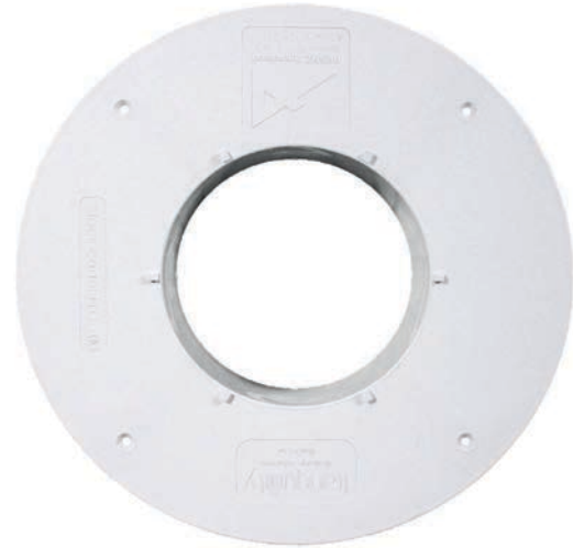
Tile flange – 100mm FLC100