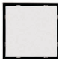
Point drain TILE INSERT FD11XS65-T