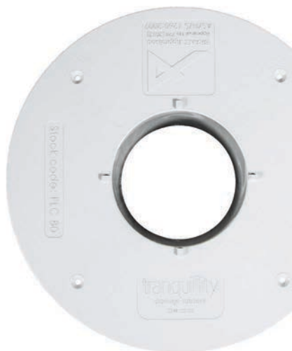
Back to wall flange – 80mm BFLC80

The Tranquillity new back to wall flange allows a closer installation of your channel drain to the wall.