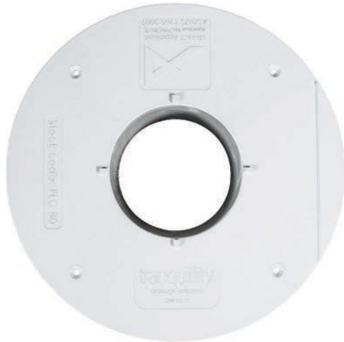
Tile flange – 80mm FLC80

The Tranquillity standard flange acts as an extra seal between the drain and your bathroom tiles.