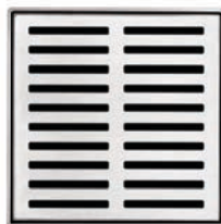
Point drain LINEAR FD11XS65-L