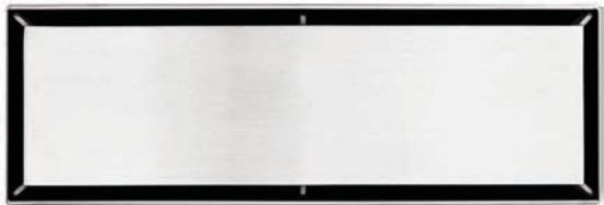
Channel drain – 300mm SOLID – BRUSHED STAINLESS FDTB300W

BRUSHED STAINLESS FDTB 800 SS / FDTB 900 SS / FDTB 1000 SS / FDTB 1200 SS BRUSHED MATT BLACK FDTB 800 SS Black / FDTB 900 SS Black / FDTB 1000 SS Black / FDTB 1200 SS Black BRUSHED GUN-METAL FDTB 800 GM / FDTB 900 GM / FDTB 1000 GM / FDTB 1200 GM BRUSHED BRASS FDTB 800 Brass / FDTB 1000 Brass / FDTB 1200 Brass