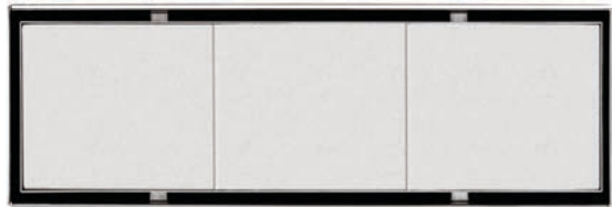
Channel drain – 300mm TILE INSERT FDT300W