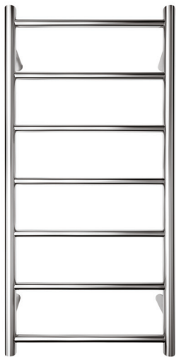
Ensuite 7 bar ROUND MENR7