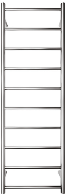
Ensuite 10 bar ROUND MENR10